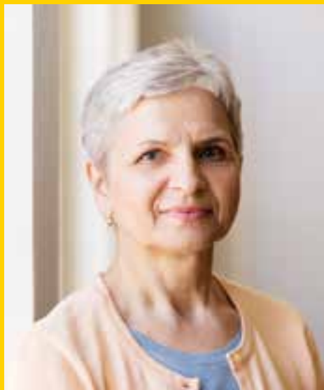
Picture posed by model

"I was deeply shocked but the incident showed me how important personal safety is. Now I always make sure the bathmat is in place.